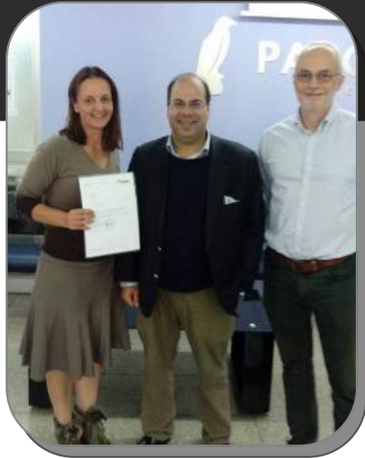
ZEME Fuels and Alloys—SPONSORS for EYP