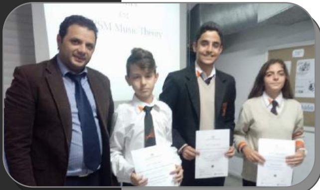
Music Exam Certificates