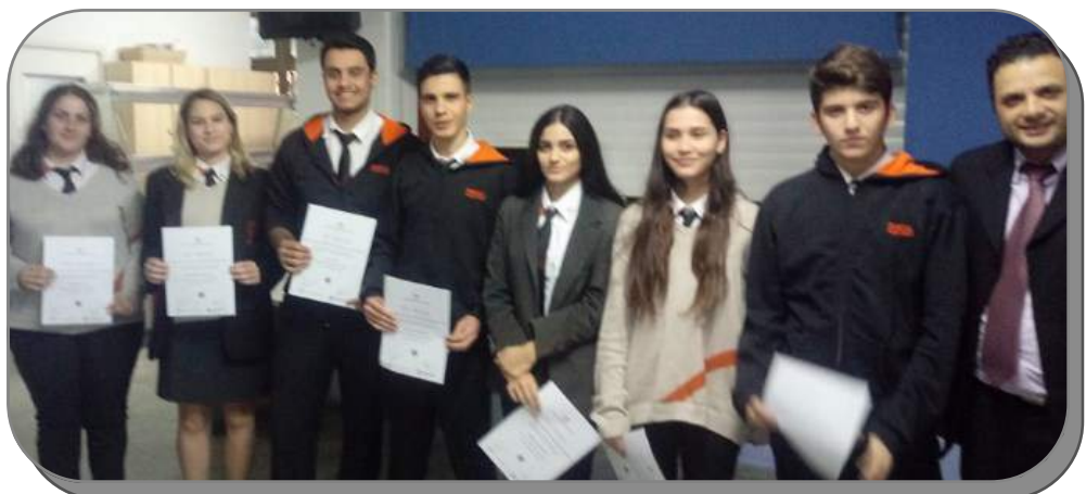
Queens Commonwealth Award Winners