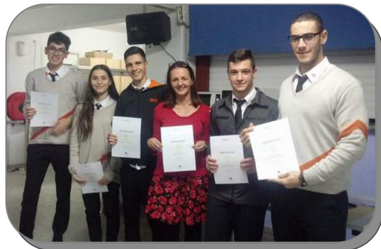
Generation Euro Participants