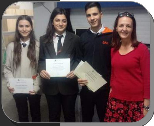
Innovation Challenge Participation